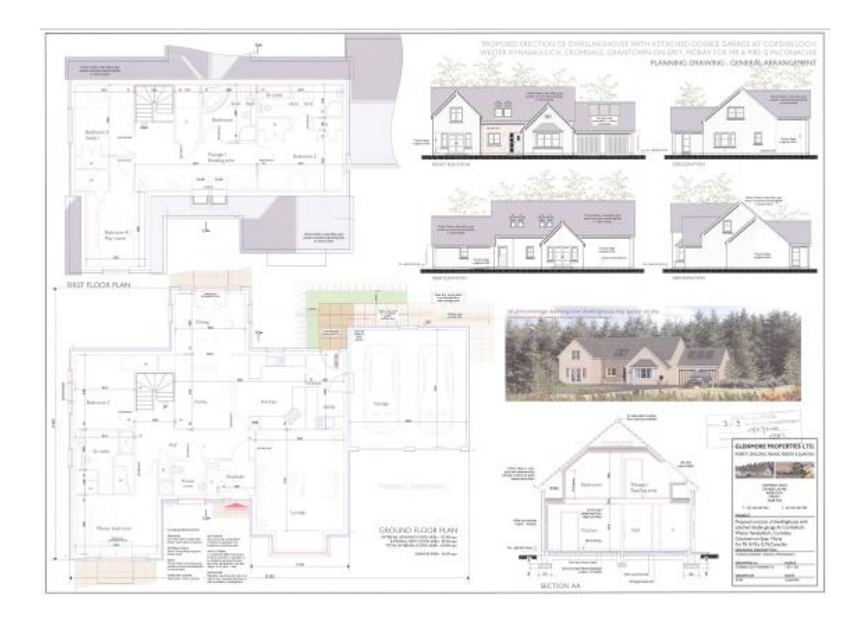
Fig. 7- Elevations/Floor Plan