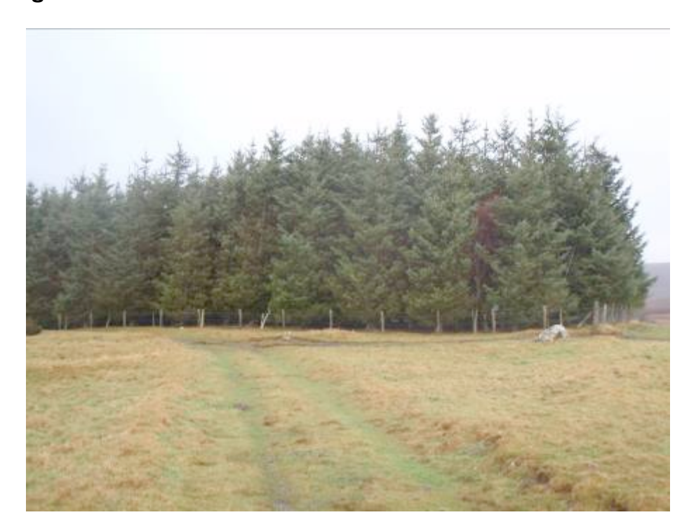
Fig.4 – View of the site of the house