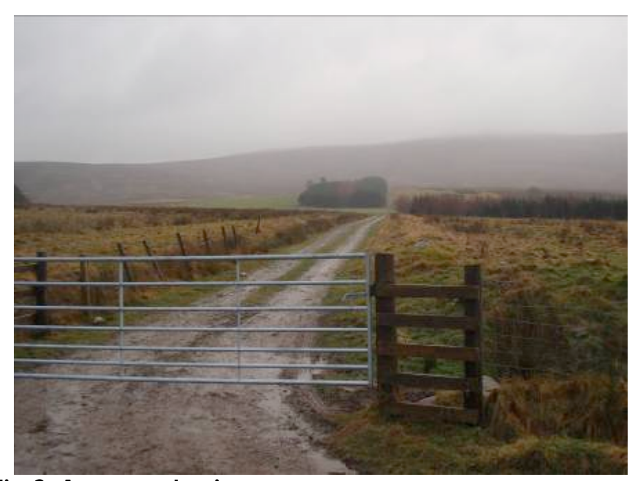
Fig. 2- Access to the site