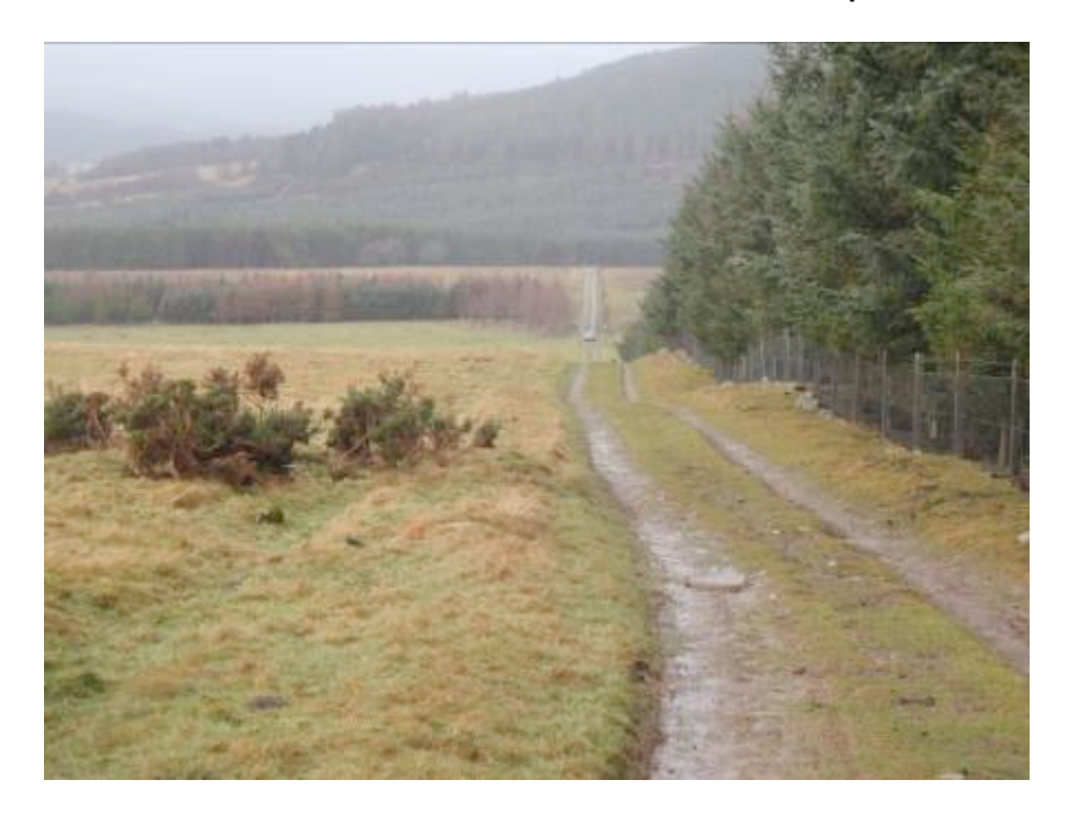
Fig. 5- View of site looking back towards the public road.