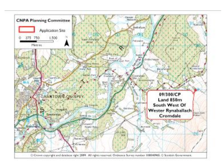
Fig. I - Location Plan