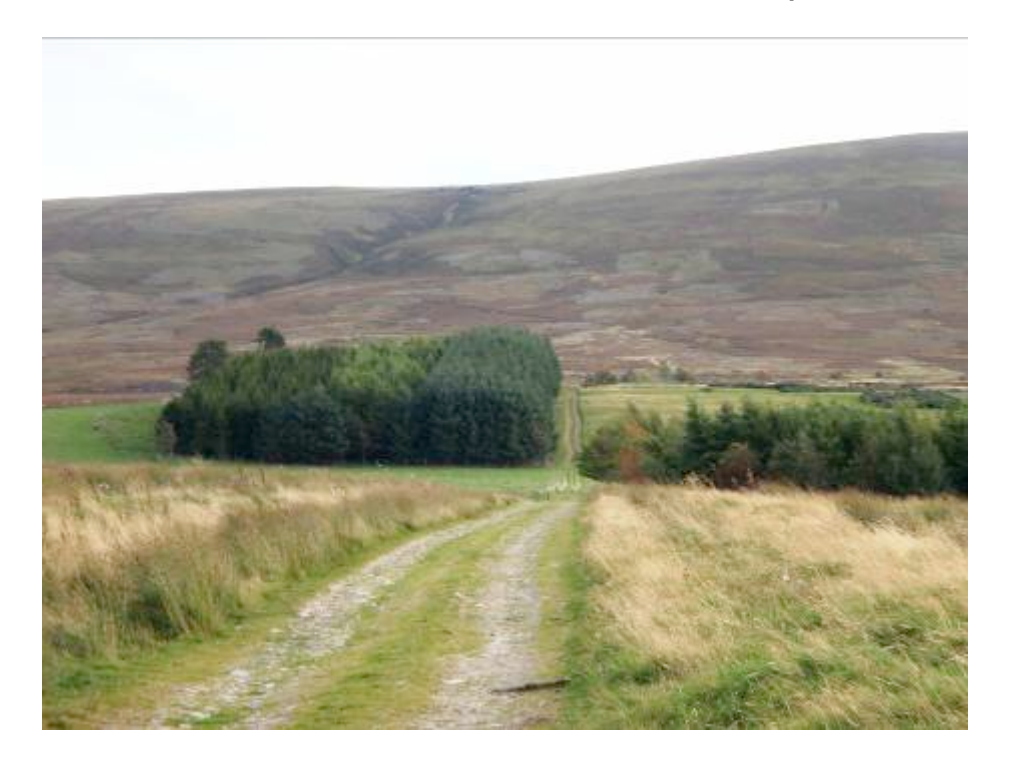
Fig. 3- House site to the rear of the shelterbelt